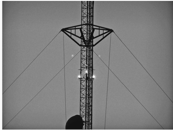
PLATE 1. In May and September 2003–2005, technicians searched under Michigan, USA, communication towers for avian carcasses. Migratory birds collide with these structures and their supporting guy wires during periods of attraction to the nighttime lighting systems. Numbers of avian carcasses were compared among towers with different Federal Aviation Administration lighting systems.

Manville, unpublished manuscript ). Therefore, changing FAA obstruction lighting provides virtually the only means of reducing fatalities at existing towers.